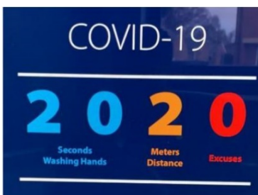
Signage to promote hygiene and social distancing measures