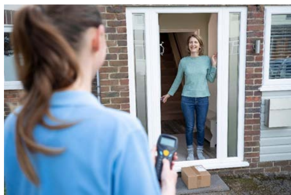
Contact free delivery